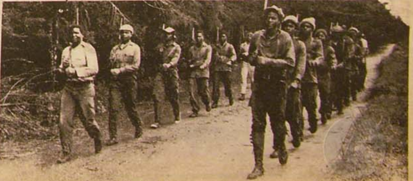
Zimbabwe People's Army (ZIPA) soldiers march to fight against Ian Smith regime of Rhodesia.

ZIPA's attitude is that those who join Smith's army are misguided Zimbabweans. They need to be doubly liberated. First they need to be liberated from the national oppression. They are oppressed just like any other Zimbabwean. Secondly, they need to be liberated from the oppression they suffer within the racist army. They occupy an inferior position in the racist army. So we sympathize with them. Our struggle is to liberate all oppressed Zimbabweans in Zimbabwe today. Recently the number of deserters from the racist army joining the ZIPA ranks has risen to astronomical proportions. Hundreds and hundreds of them come to our ranks. Some of them with their weapons.