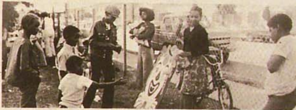
Children occupy themselves with games at San Antonio Community Festival (above), while (left), crowd gathers to listen to the soulful band tunes.

(Oakland, Calif.) - Close to 500 people came out to a lively and enjoyable Community Festival at Greenman Field here in East Oakland last Saturday, in an event sponsored by the San Antonio Tenants' Union. Residents from the San Antonio Villa and Lockwood Gardens housing projects thoroughly enjoyed an afternoon of good food, good