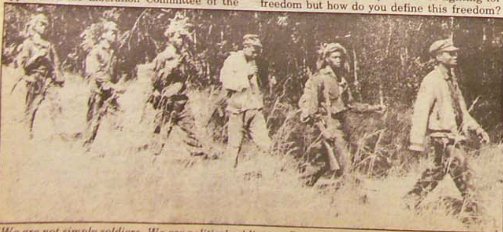
"We are not simply soldiers. We are political soldiers. . . Our political goal is to overthrow national oppression in Zimbabwe."

MACHINGURA: The masses are organized in units and they are democratically conducting their day-to-day business under the leadership