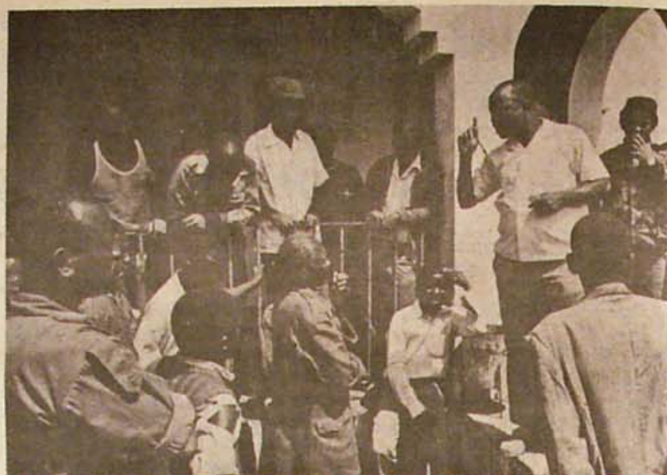
Angolan Provincial Commissioner ARMANDO DEMBO (finger raised) speaks at village meeting.

The Benguela Railway is still owned by Tanganyika Concessions, and in Lobito, its western