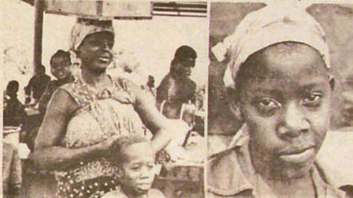
Scenes from People's Angola : Woman in marketplace (above, left); young girl (above, right); and revolutionary women soldiers (bottom).

Coffee experts say that without a full coffee harvest this year new coffee cannot be planted for next year. Failure to regularize the coffee industry once again could have a serious effect on Angola's economy.