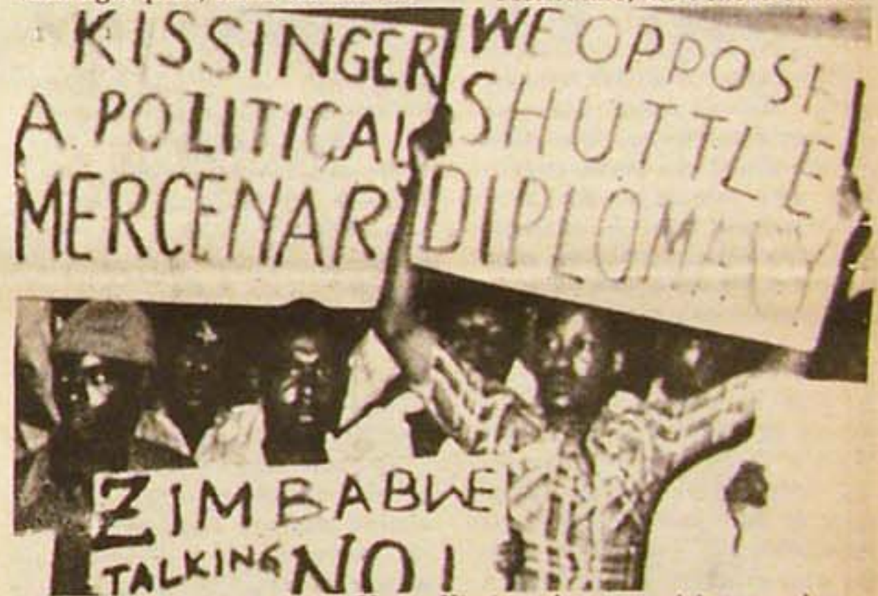
Tanzanian students protest Henry Kissinger's recent visit to southern Africa. Zimbabwean guerrillas have denounced Kissinger's "package plan" and are intensifying the armed struggle.

ence to discuss the make-up of a Black-ruled Zimbabwean government, has been postponed until October 28 at the request of the country's Black leaders. Joshua Nkomo, head of the internal wing of the African National Council (ANC), made the announcement on October 16 in Lusaka. Great Britain is the convener of the conference.