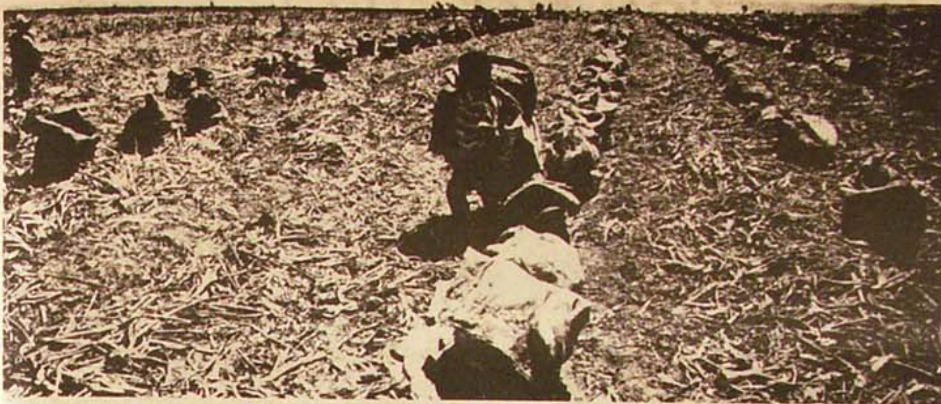
Child laborer (center) toils under hot sun on California farm.