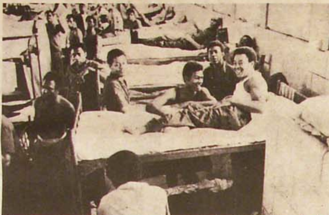
Black inmates are crowded into prisons throughout the country due to unjust convictions by all-white juries.

The defense objected that all four of the Black persons eligible for jury duty had been excused that way. Newman stopped the proceedings at that point to allow