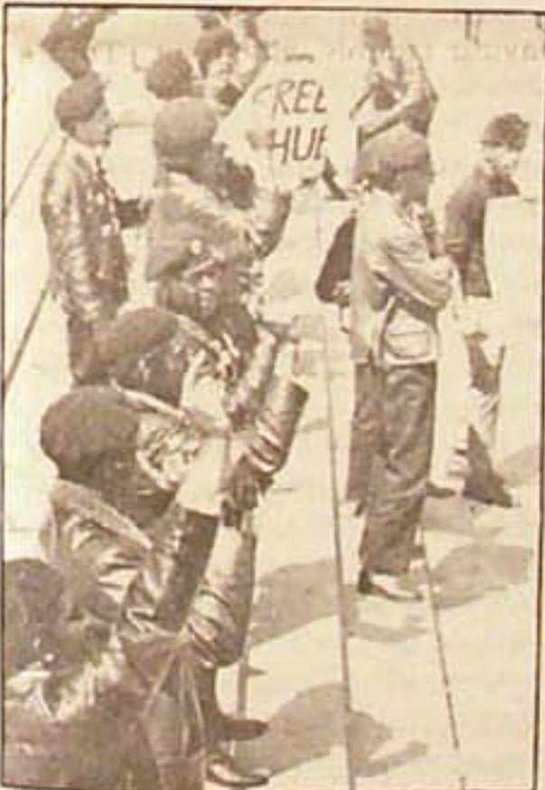
Black Panther Party members and supporters demonstrate in July, 1968, "Free Huey" rally.

The morning my trial began, on July 15, 1968, in the Alameda County Courthouse, 5,000 demonstrators and about 450 Black Panthers gathered outside to show their support. Busloads of demonstrators came from out of town and joined the throng that crowded the streets and sidewalks outside the courthouse. Across the street from the building a formation of Black Panthers stood, lined up two deep, and stretching for a solid block.