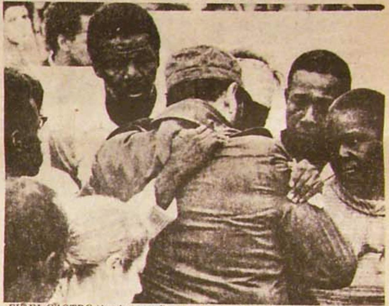
FIDEL CASTRO (back turned) consoles family of CIA bombing victim. They told Fidel, "This is not only my son. I have three and they, too, are your sons."

"Official insensitivity, coupled with private and public acts of discrimination, has assured that Puerto Ricans are often the last in line for benefits and opportunities made available by the social and