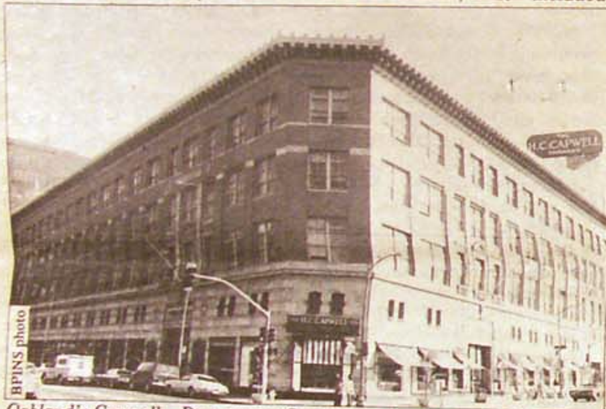
Oakland's Capwell Department Store is the target of a $100,000 suit due to its discrimination against minority and female employees.