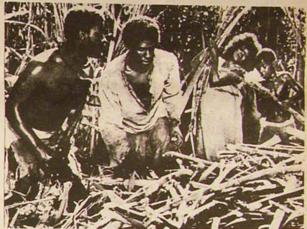
Slaves cut sugar canes in scene from the Cuban film, The Other Francisco (second from left).

Francisco was kidnapped from Africa at age 10 and brought to Cuba. The mistress of the plantation where he was sold took a personal interest in him, educated him and allowed him to