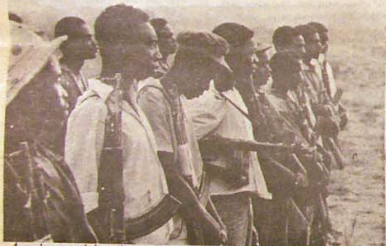
Angolan people's militia (above photos). The people of Angola remain vigilant as they attempt to rebuild their war-ravished country. Prime Minister Lopo de Nascimento stated, "Only when Angola is the owner of its own wealth will it be fully independent."