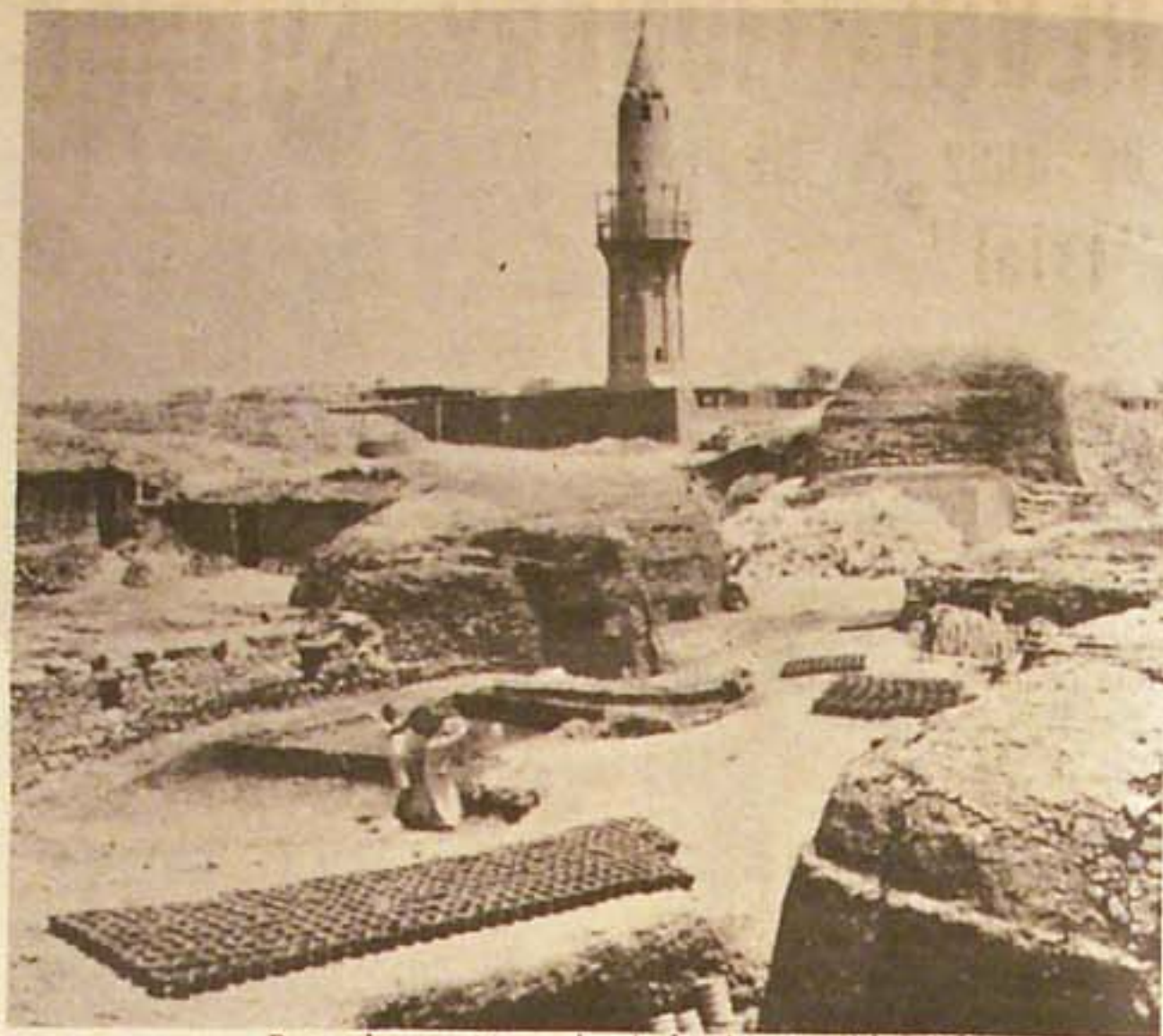
Potter's quarter on buried ruins outside of Cairo.