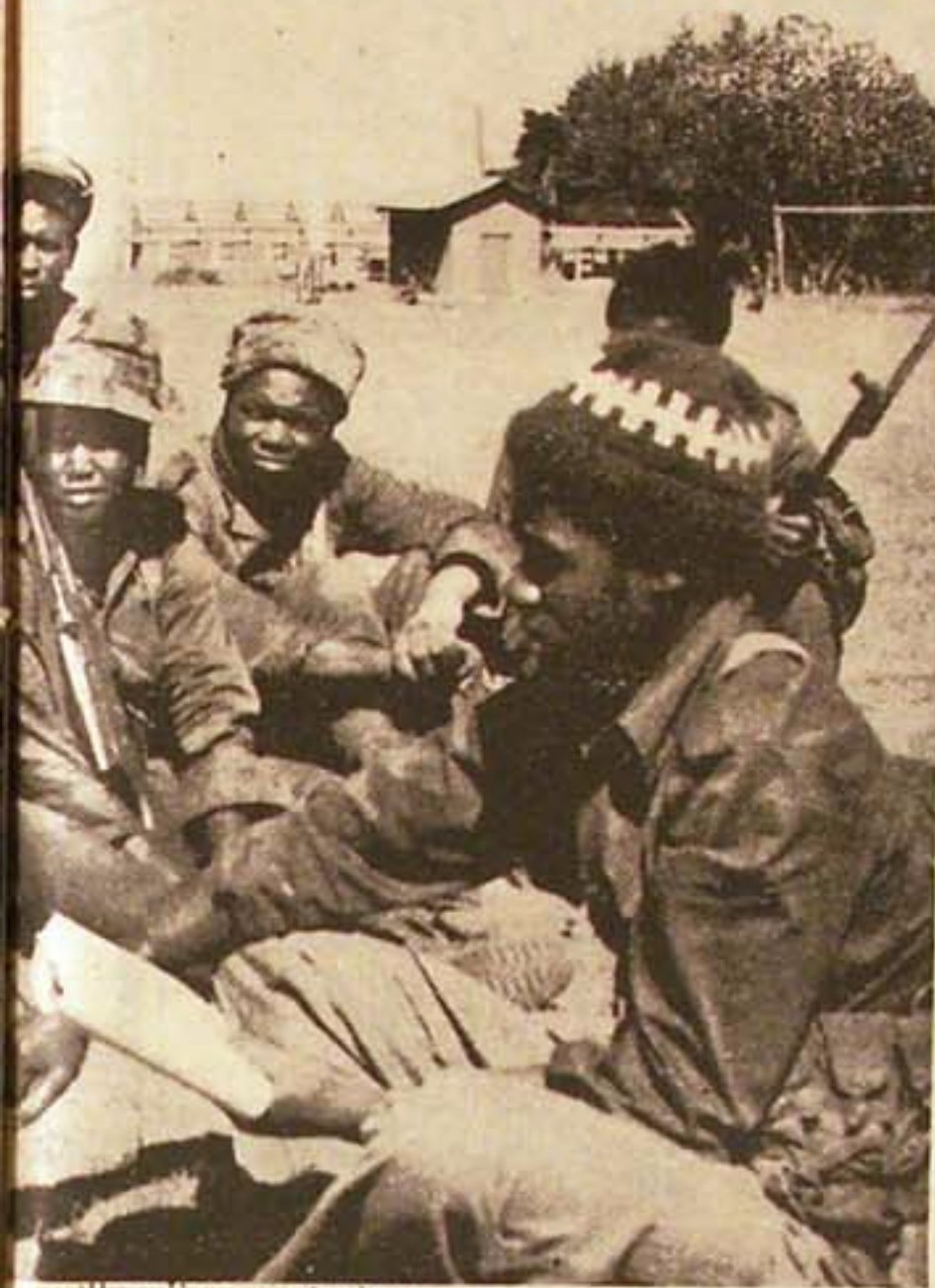
Guerrillas discuss strategy.

creating the idea that in an all-out war between Mozambique and Rhodesia, the young People's Republic would stand to lose.